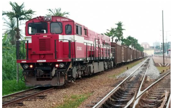
Freight transport in Cameroon

Shift to low-carbon transport modes through promotion of: