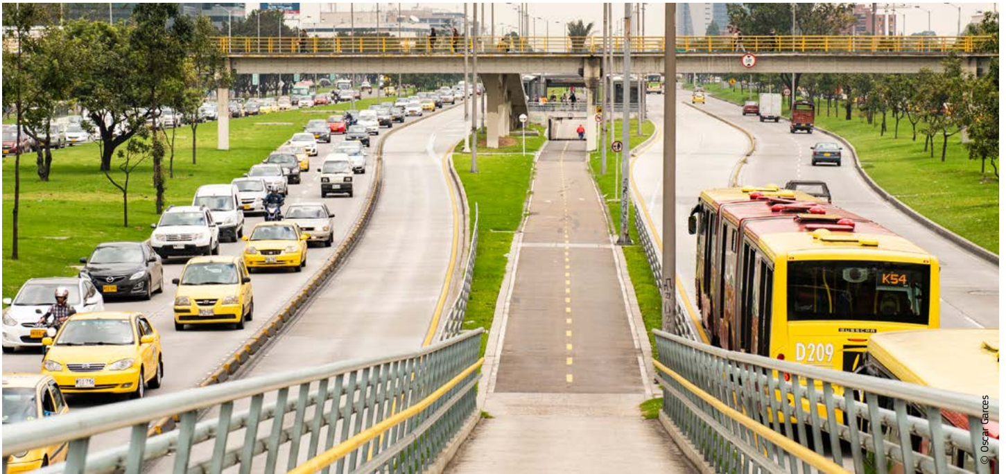
Multi-modal transport in Colombia