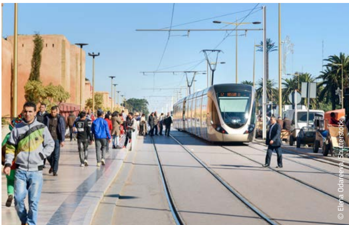
Tramway in Rabat, Morocco